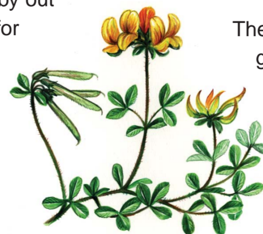
Common Bird's Foot Trefoil

Common Blue and Meadow Brown Butterflies fill the air in summer as well as the day flying Six Spot Burnet Moth in late summer.