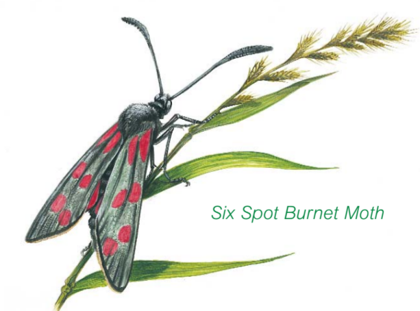
Six Spot Burnet Moth

The pond provides a breeding ground for Common Frogs and Common Toads as well as supporting dragonflies and Damselflies including the Blue tailed Damselfly . Kingfishers can also be seen fishing for Sticklebacks .