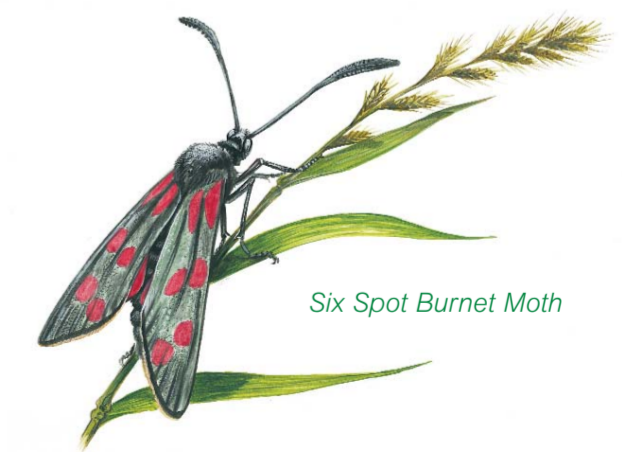
Six Spot Burnet Moth

The pond provides a breeding ground for Common Frogs and Common Toads as well as supporting dragonflies and Damselflies including the Blue tailed Damselfly . Kingfishers can also be seen fishing for Sticklebacks .